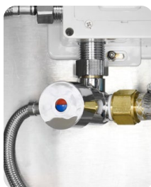
Faucet Temperature Control