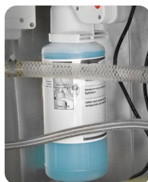
Soap Cartridge and Battery