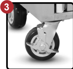
Built for Transport