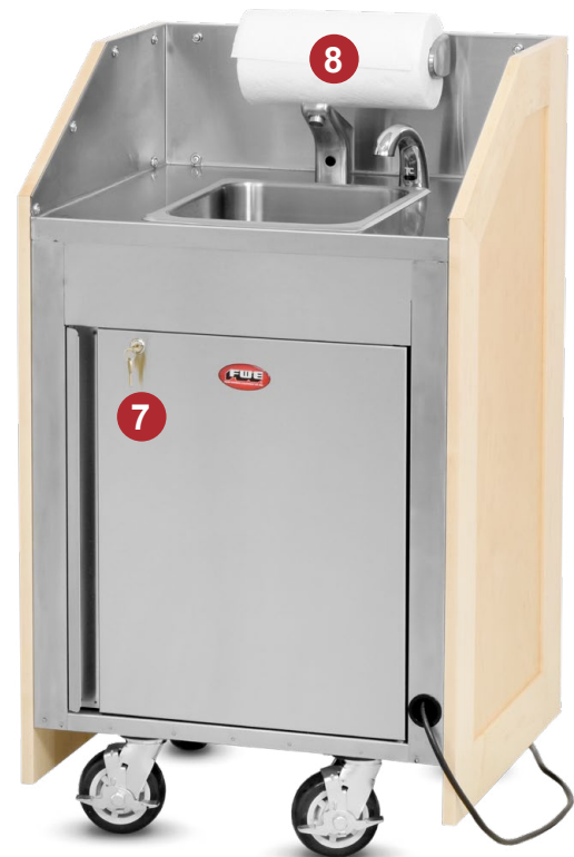
EXECUTIVE SERIES (MAPLE WOOD) NATURAL FINISH