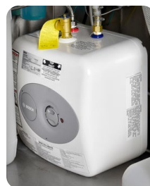
2.7 Gallon Water Heater