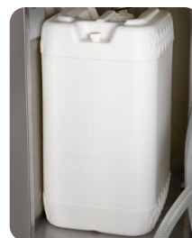
7.5 Gallon Wastewater Tank