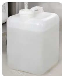
5 Gallon Fresh Water Tank