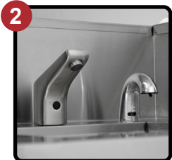
Touchless Faucet &amp; Soap Dispenser